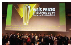
Runners-up at The World Summit on the Information Society (WSIS) 2016 and 2019