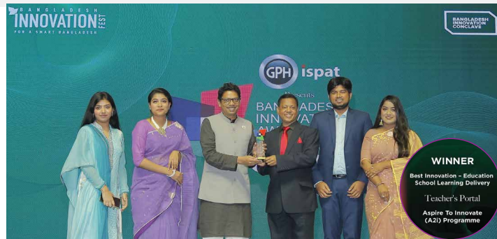
Winner of Bangladesh Innovation Award for Best Innovation- Education (School Learning Delivery)